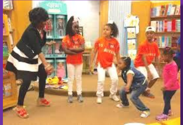
PLAYING A GAME WITH CHILDREN THROUGH A READING PROGRAM AT BARNES AND NOBLE