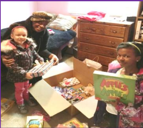
PROVIDING CHILDREN AND FAMILIES WITH GIFTS FOR THE HOLIDAYS.