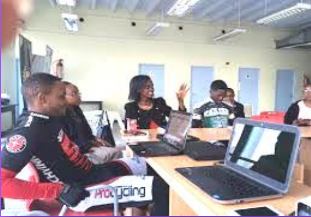
EMPOWERING YOUNG MEN AND WOMEN ENTREPRENEURS