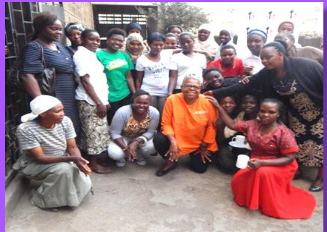
EDUCATING WOMEN IN KENYA WITH NEW BUSINESS SKILLS